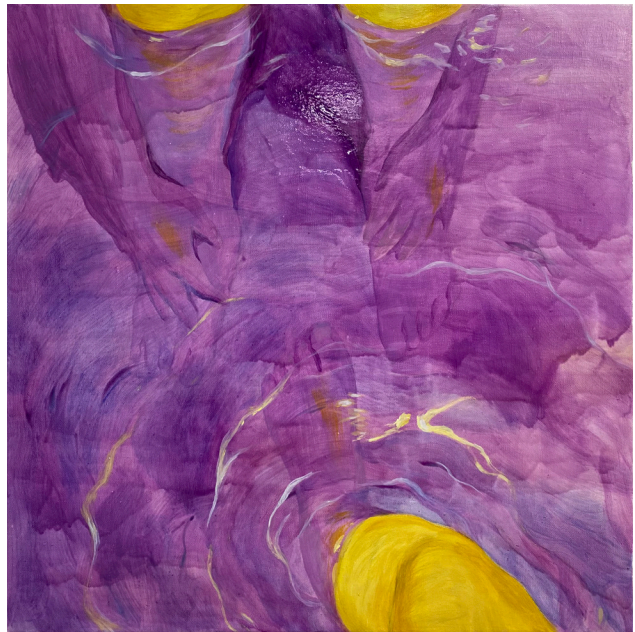
Shunshun Qi, Under the Water , Oil on Canvas, 50 x 50 cm