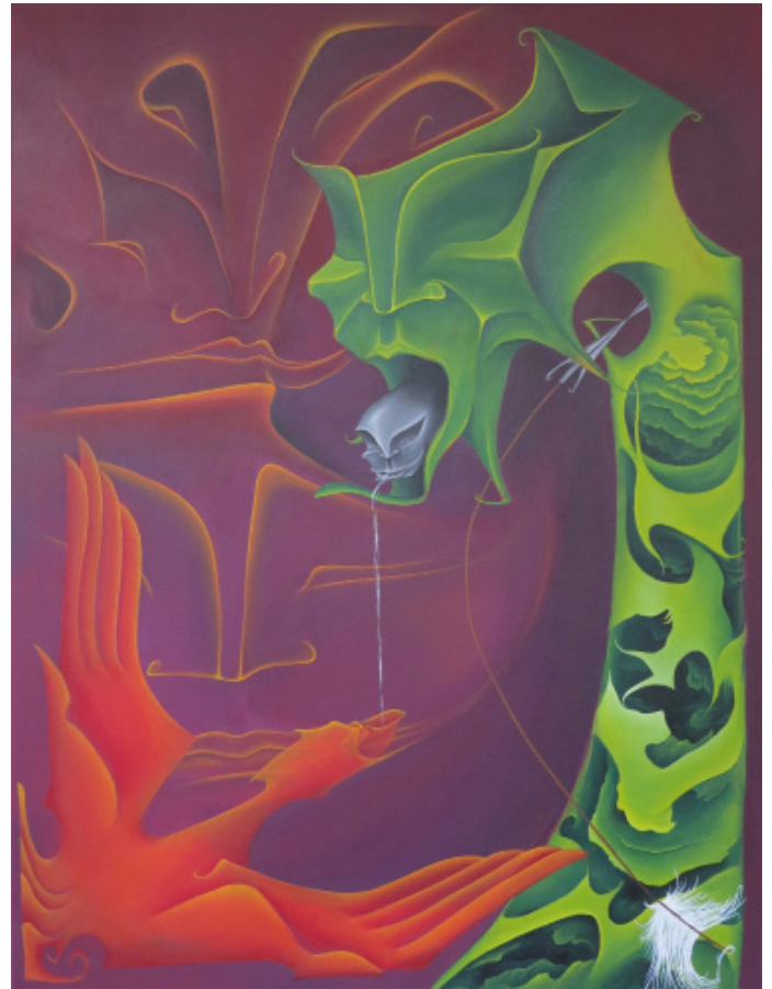
Alfie Rouy, Swyft Arrow , Acrylic on Canvas, 100 x 70 cm