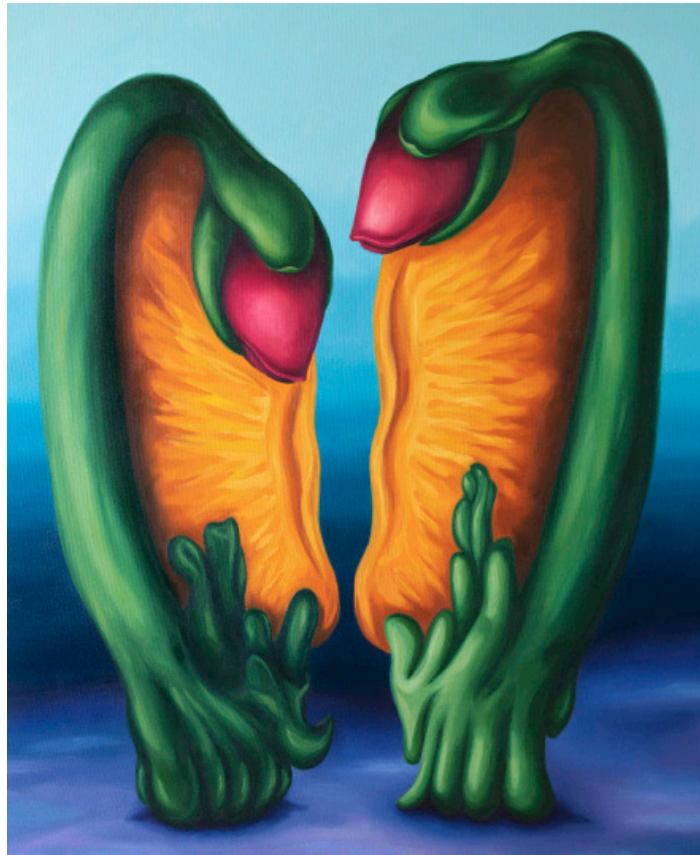
Kora Moya Rojo, El Transplante , 2022, Oil and Acrylic on Canvas, 100 x 120 cm

As a Spanish / British national, Kora Moya Rojo explores themes of displacement and nostalgia. In this new body of work, The Transplant , she creates colourful biomorphic still-lives depicted in a neo-surrealist style. Her canvases portray mutated food which pulsate with rich and bold colours, whilst her hyper-realistic ceramic fruits deceive the viewer into questioning the boundaries that separate the real from the unreal. Moya Rojo's paintings depicting foodstuffs such as rhubarb, beetroots, and cheddar crisp, become eroticised through her intoxicatingly potent colour palette; combining Spanish and British gastronomy with art, Moya Rojo's new body of work calls into play the nostalgia food provokes through smell, taste, and sight. Embodying these senses in her work through a hybridised depiction of tapas and British dishes, she captures a sense of how her mixed identity can create a sense of displacement and nostalgia.