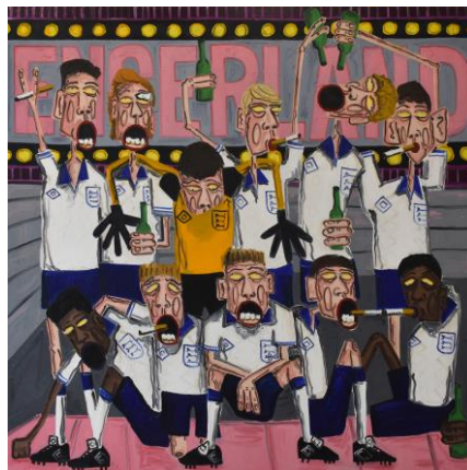
Will Harman, E is for Engerland (2020), Oil and Acrylic on Canvas, 180 x 180cm

It's Really Like That reveres the awkward, crude and comedic aspects of the everyday, with participating artists demonstrating an ability to confront and confess in equal measure. Whether found in the razor-sharp treatment of 'lad' culture in football or introspective portraits that reveal interpersonal dynamics, each painter's visual language bears the authenticity of a diarist. Whilst each artist draws upon personal experience, the fallibility of memory supervenes on observation: playful touches of the surreal and exaggerated run throughout. The exhibition beckons visitors to laugh, cringe and emote: to be unapologetic and unembarrassed by the less than perfect parts of our experience.